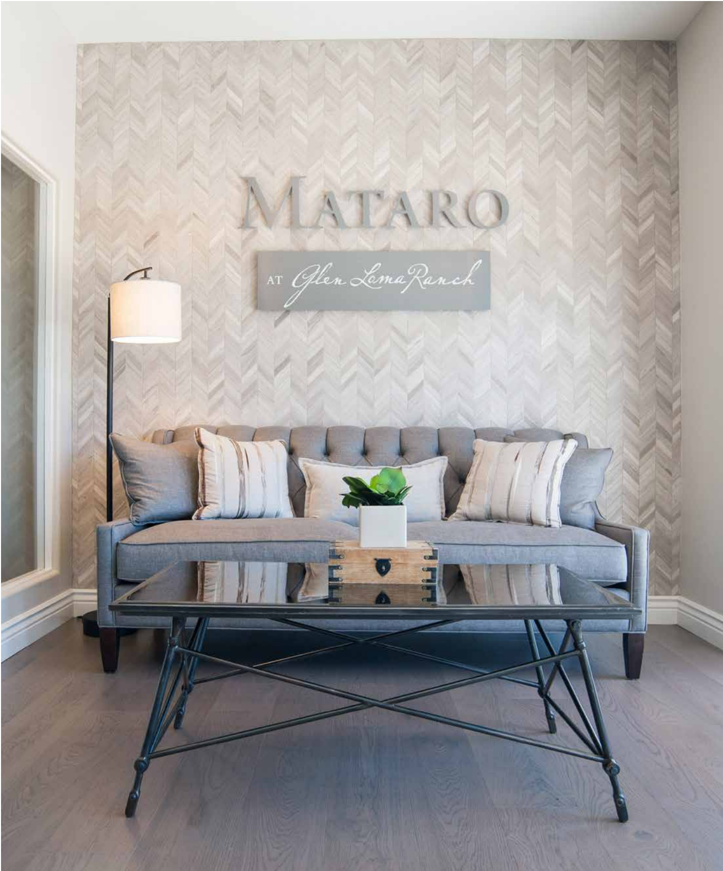
Mataro , Brookfield Residential