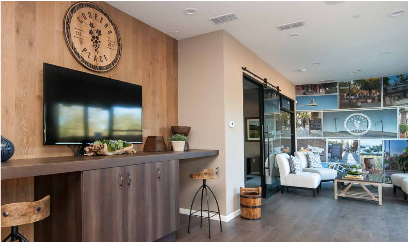
Coopers Place, TRI Pointe Homes